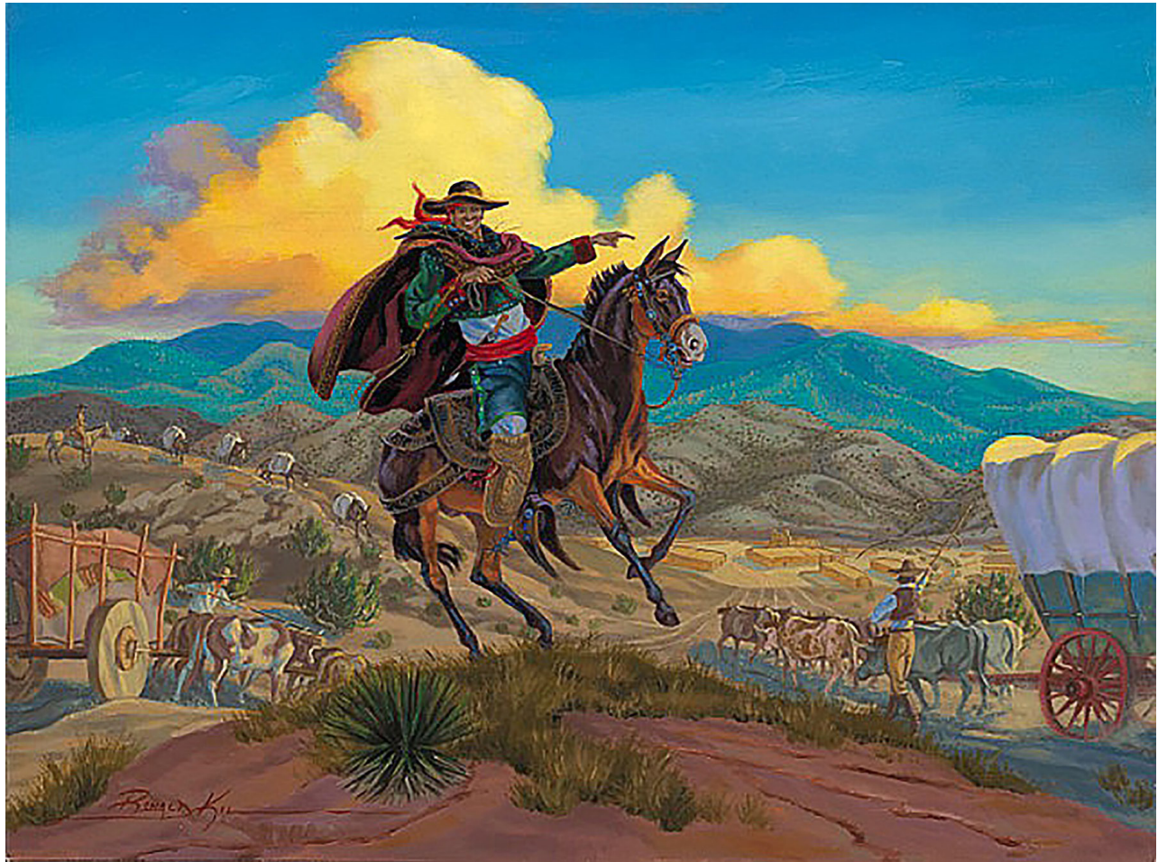
Oil painting by Ronald Kil ©

A joint conference of three historic trail associations